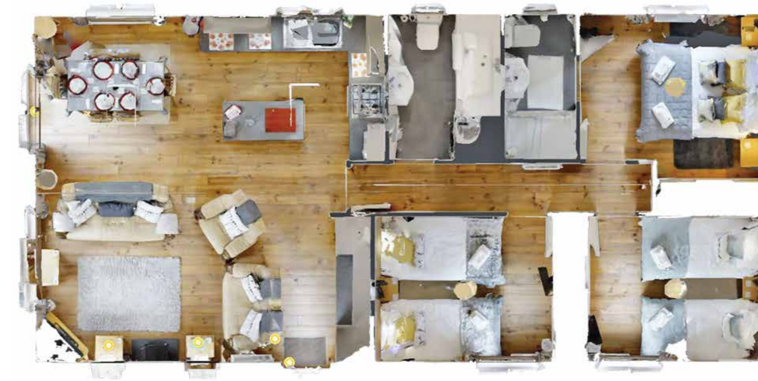
A typical 3 bed 2 bath layout

It is quick and easy to get to us as Manchester or Leeds is only 80 miles away, Sheffield 50 miles, Nottingham 25 miles, Birmingham 35 miles, and Oxford just over 100miles.