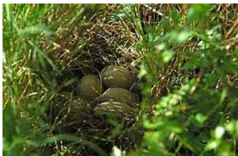
Tufted ducks nest in pairs or loose groups with nests near water about 10 metres apart. Females

Much quieter than many duck breeds they have a deep grating growl while the male uses a nasal whistle during courtship.