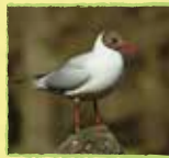
Black Headed Gull