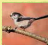
Long Tailed Tit