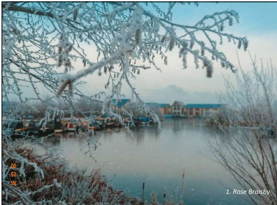
1. Rose Braisby