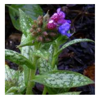
COTTAGE GARDEN – Rosemary is in full flower, Pulmonaria as well, these are early too.

BUMBLEBEES – Many Queen bees have been spotted, while this is not particularly unusual with some species a lot of reports are suggesting these have Yellow bottoms which may mean that they are the Early Bumblebee. Despite the name these usually appear in March. If this is what they are we have not recorded them before.