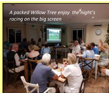
A packed Willow Tree enjoy the night's racing on the big screen