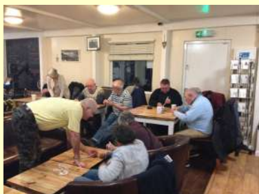
Rope Splicing Evening

recent arrivals. This, therefore, is a time for MAC to hear from all those who perhaps haven't stuck their hand in the air before now (didn't know anyone, didn't feel they could, didn't believe it was for 'them') whether they are residential or leisure moorers, lodge owners or, in deed, whether they have been here for ages but haven't wanted to get involved until now.