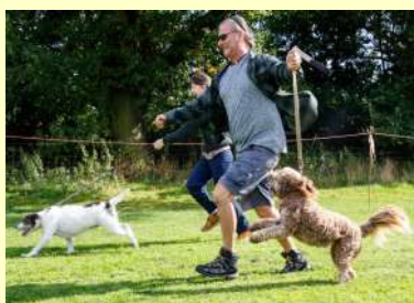
The ReX Factor