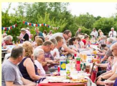
Marina Street Party