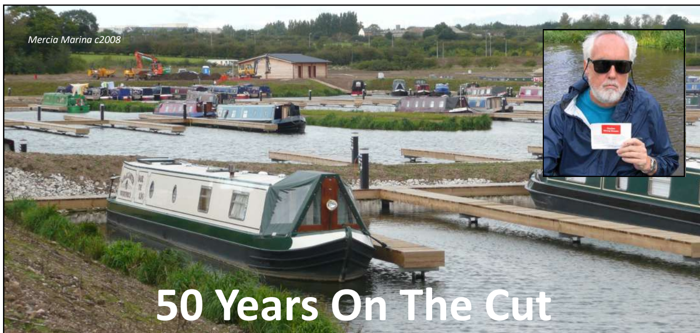
Mercia Marina c2008