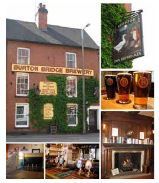
Wednesday, 6 January Skittles Night at the Burton Bridge Inn, Burton on Trent