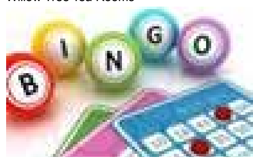
Wednesday, 27 January 7pm Bingo Night at the Willow Tree Tea Rooms (find all the details on the Marina Community Facebook Page or ask in the Office)