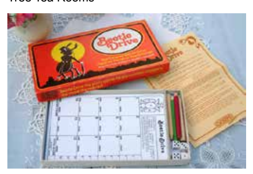
Wednesday, 13 January 7pm Beetle Drive at the Willow Tree Tea Rooms