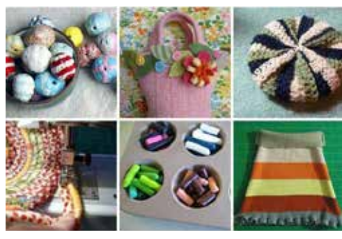
Wednesday, 6 January 7pm Craft Night at the Willow Tree Tea Room