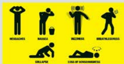
Symptoms of CO poisoning