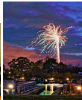
Fireworks (Ian Carroll)